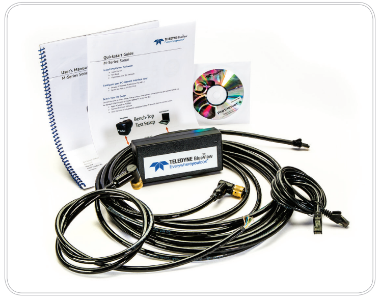
The Teledyne BlueView M900-30 Sonar accessories and case.